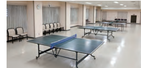
Table tennis court