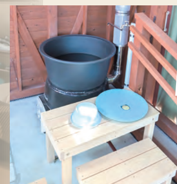
Enjoy the luxurious comfort of Goemon-buro, a Japanese traditional bath, and tent sauna that sooth both body and soul.