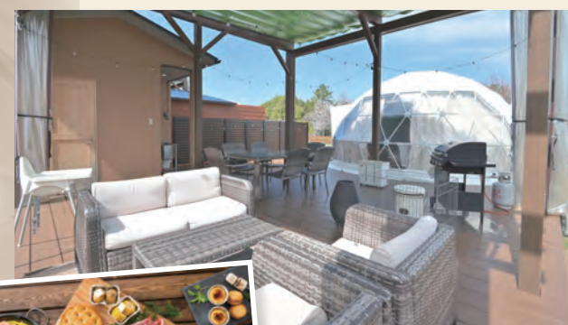
Enjoy BBQ on the terrace, and both Japanese- and Western-style dining inside the hotel.

Suntopia offers hotel-like comfort in an unforgettable glamping experience with well-appointed private bathrooms, a roofed terrace, and air-conditioning in all rooms, and the chance to enjoy a wide range of activities.