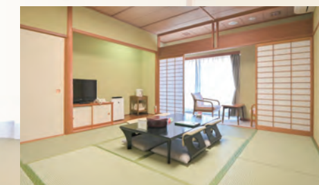
Japanese-style room (10 tatami mats)